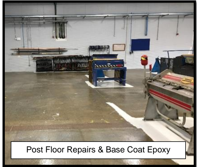
Post Floor Repairs & Base Coat Epoxy