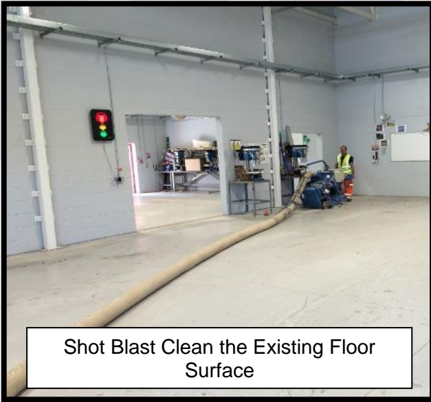
Shot Blast Clean the Existing Floor Surface