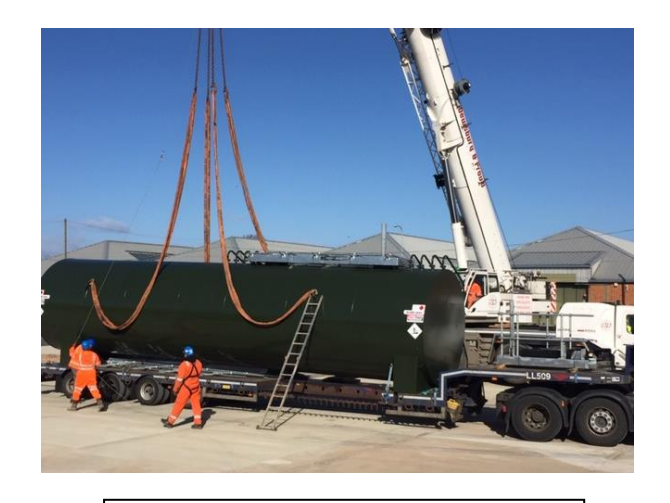
Contract lift new 60,000ltr fuel tank onto new concrete slab