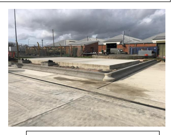
Cast new r/f concrete slabs, lay Aco channels & Trief kerbs