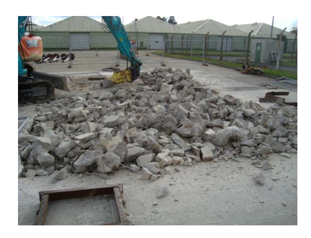
Break out of r/f concrete slabs