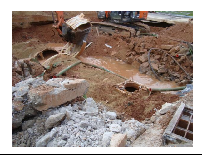
Excavate existing fuel tanks for removal off site