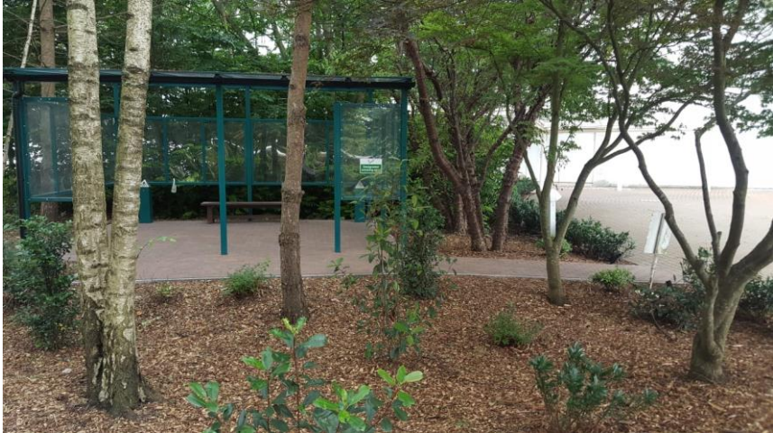
Finished shelters from various locations across site, newly laid block paving and planted shrubs.